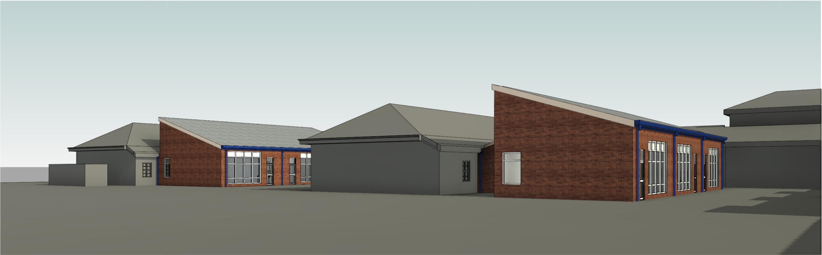
Proposed Illustrative View - V1 @ A1